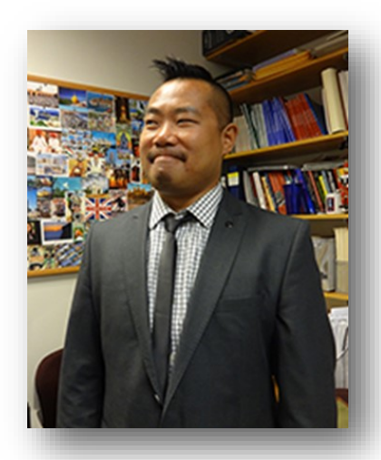
Submitted by AAPA Finance Officers: